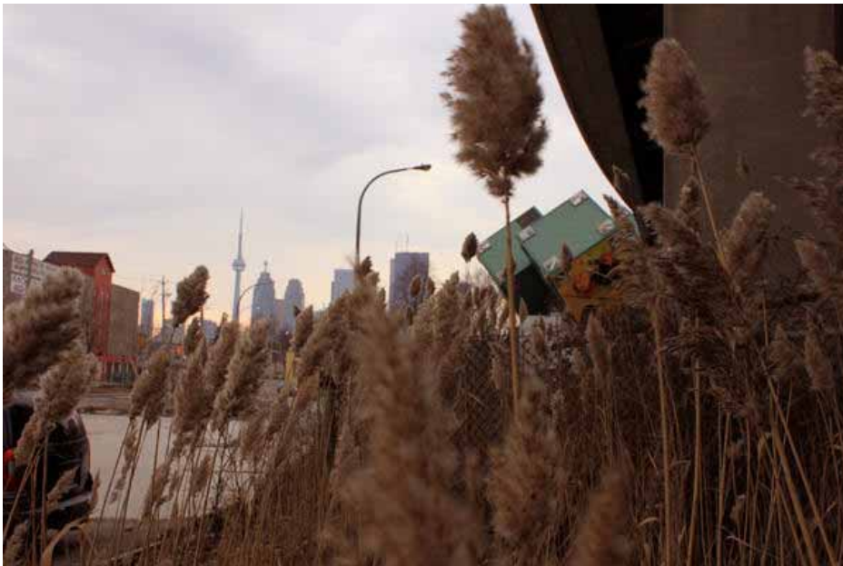
People using the basketball courts and kids on the playground won't have to run for shelter in the rain. Half of